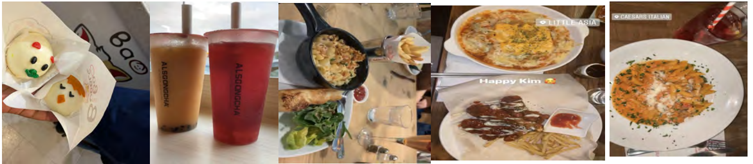
Caesar's Italian Restaura

Bao/Meow: If you are craving some Gyoza and bubble tea stop at Meow in town (76 Goodramgate, York YO1 7LF). It has a nice ambiance with some great Kimchi Gyoza. Meow is an extension of the Bao restaurant in the shambles I was discussing earlier.